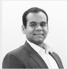
CO-FOUNDER & MODELLING EXPERT