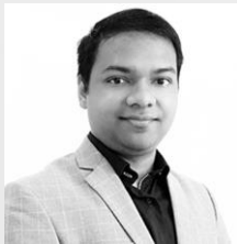
FOUNDER & TECH EXPERT